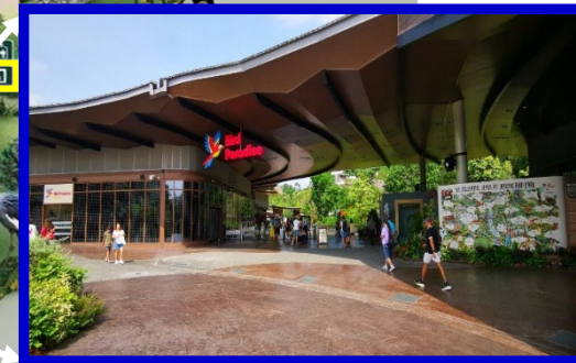
Bird Paradise Main Entrance 飞禽公园正门