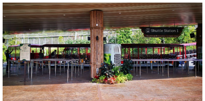
The Tram Station 电车穿梭站

11. Alternatively, you may follow the sign to Sky Amphitheatre