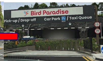
Car park entry 停车场入口