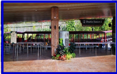
Tram shuttle station 电车穿梭站