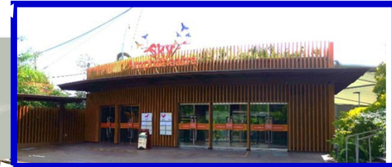
Sky Amphitheatre 露天剧场