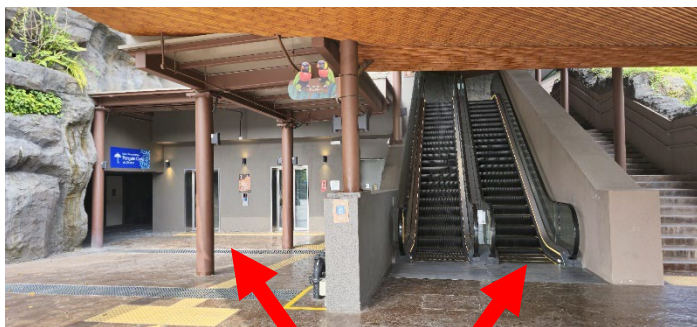
Lift 电梯 Escalator 自动扶梯