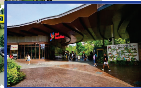
Bird Paradise Main Entrance 飞禽公园正门