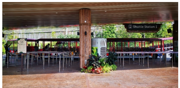
The Tram Station 电车穿梭站