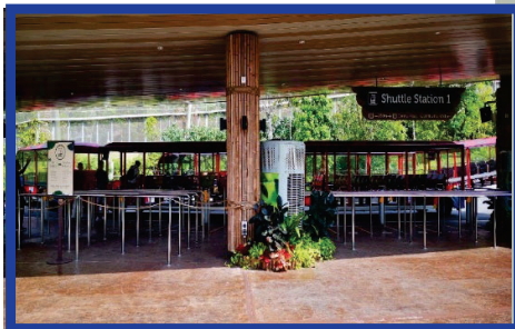
Tram shuttle station 电车穿梭站