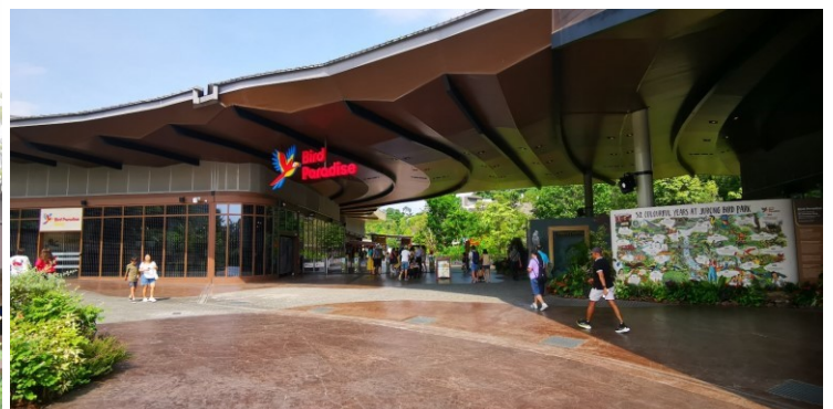
Bird Paradise main entrance