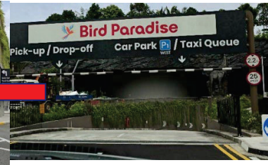
Car park entry 停车场入口