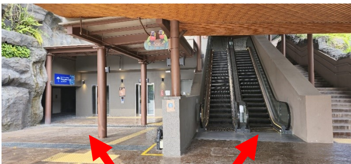
Lift 电梯 Escalator 自动扶梯