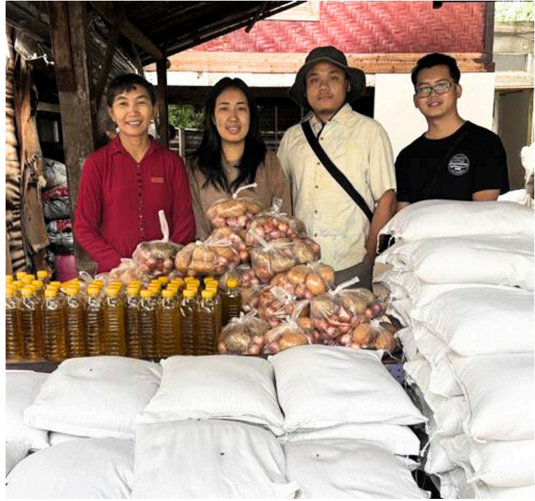
The OM team assessing the needs and offering aid to communities affected by the earthquake in Myanmar.